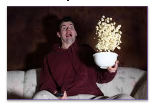
3. bored / TV show